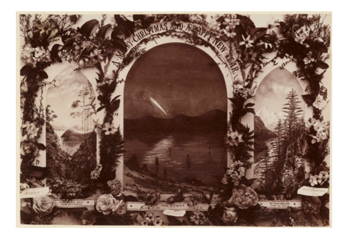
Figure 5: W. R. Frost (photography), Nathaniel Leves (artwork), Saunders, McBeath & Co. (publishers), Comet Christmas Card, 1882, Albumen silver print, 194 x 138 mm. Courtesy of Te Papa. Copy purchased 1999 with New Zealand Lottery Grants Board Funds. Te Papa (O.021671). The Te Papa reference entitles it "A Merry Christmas and a Happy New Year."

The Otago Christmas cards spanned a variety of subjects. One somewhat surprising Christmas offering was a pair of cartoons showing the retiring Dunedin mayor, James Gore, and the race for his successor,