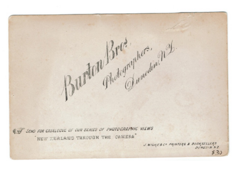
Figure 6 (top): Burton Brothers (photography), J. Wilkie & Co. (Agents), Five Comets Christmas Card, 1882, Albumen print (?), 137 x 101mm. Courtesy of the collection of Jenny Long.