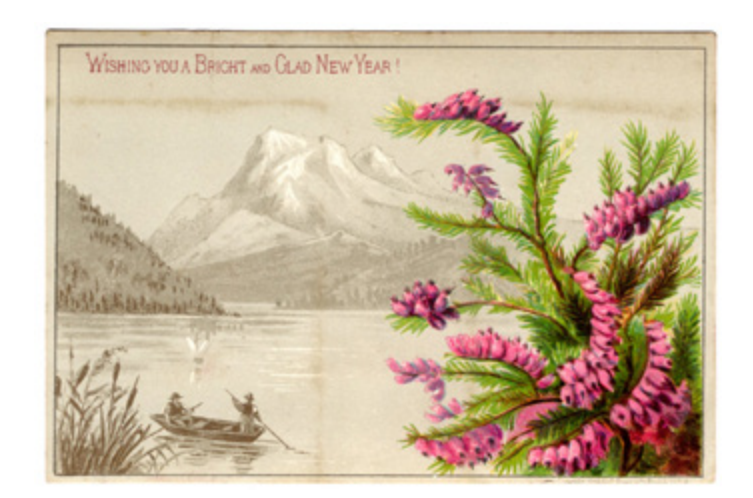
Figure 4: Louis Prang, New Year Card, 1879, Chromolithograph, 127 x 86mm. Collection of the Author.

Both Prang's competition concept and the broader nationalistic impulse struck an Antipodean chord. In 1881, Sydney firm John Sands instituted a Christmas Card competition, whose rationale effectively defined the path New Zealand publishers would subsequently take. The Sydney Morning Herald reported it thus: