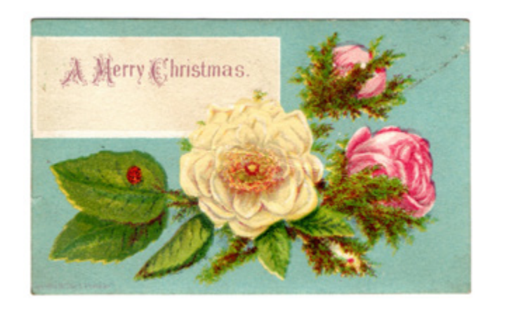
Figure 3: Louis Prang, Christmas card, 1875, Chromolithograph, 104 x 65mm. Collection of the Author.

Yet, during the same decade, perhaps as many as 200,000 Britons had immigrated to New Zealand.<sup>20</sup> This meant an influx of people imbued with contemporary British Christmas customs that increasingly included the newly-minted expectation of sending cards to absent friends and relations. With such a burgeoning potential market of migrants, all with overseas family and friends expecting to receive cards, it is not surprising that at some point, price notwithstanding, there would be a demand to send more Christmas cards 'home.' To accommodate such a demand, adverts would need to appear earlier, in time for the October Christmas post deadline. And, in 1880, adverts duly began to be placed during September, heralding an exponential increase in Christmas card advertising during 1880-2 (Figure 2).