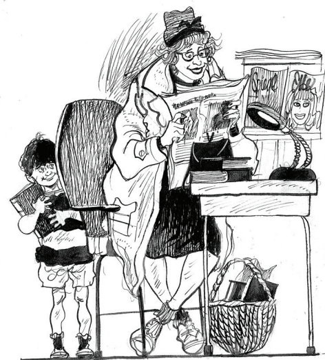
Reading the South China Morning Post Illustration for an article about a lady reading a paper in the local library—wanting news of Hong Kong (or Honkers, as she called it). 250 x 280mm N.Z Herald. 9 March 1985. Clark Family Collection