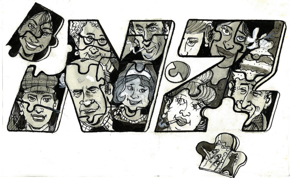
Kiwi Jigsaw 270 x 180mm. 28 September 1985.