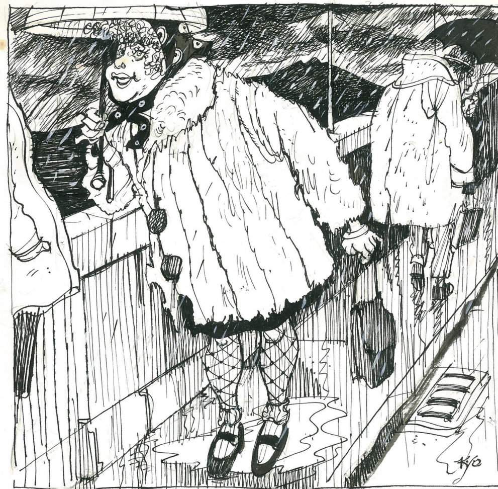
On Grafton Bridge Nobby meets a stripper on Grafton Bridge, on her way back from buying blood capsules for a vampire act. She's visiting a friend in hospital. 238 x 230mm. 8 August 1985. S Clark collection