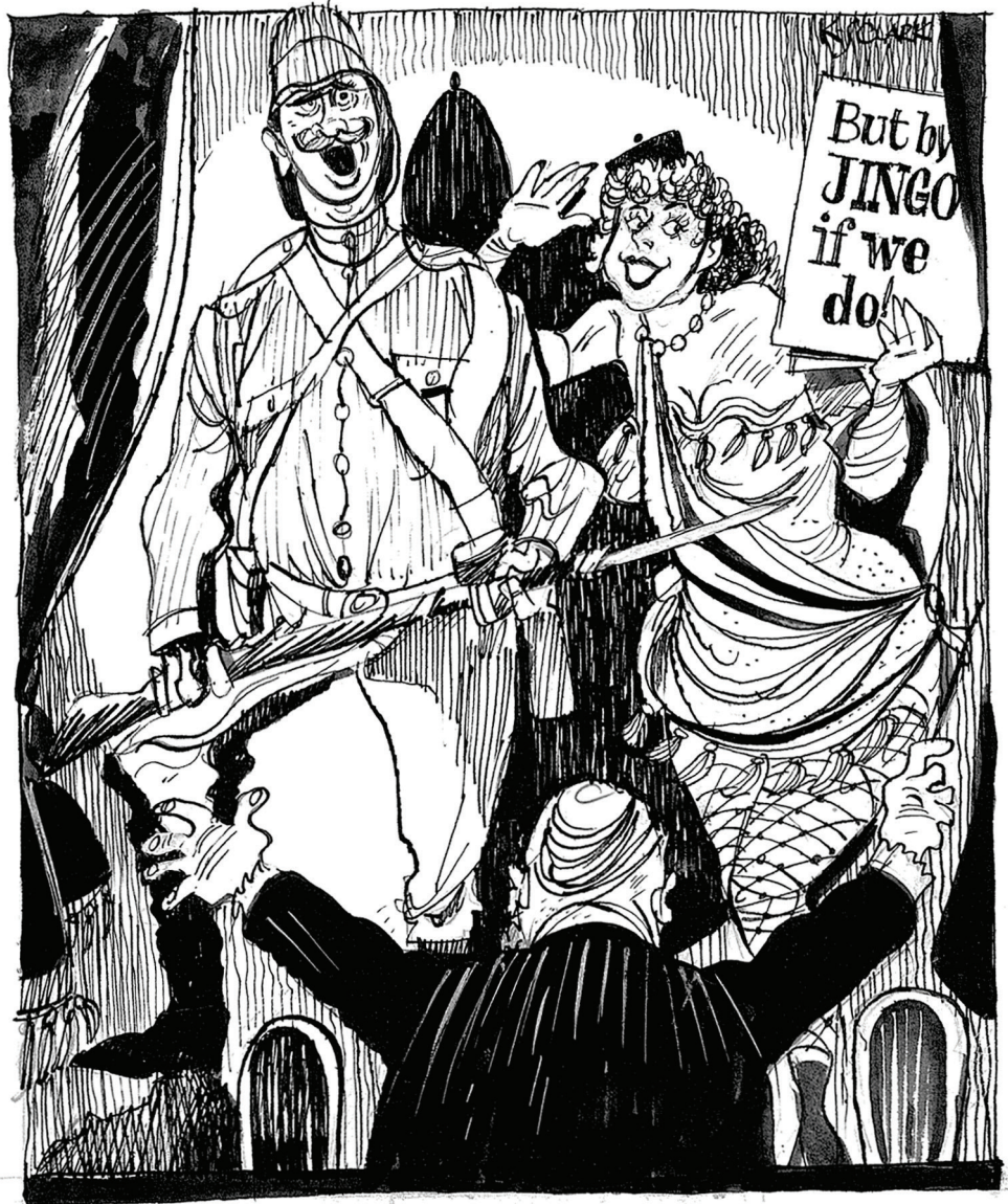
Music Hall Jingo 175 x 215mm N.Z Herald. 26 July 1986.