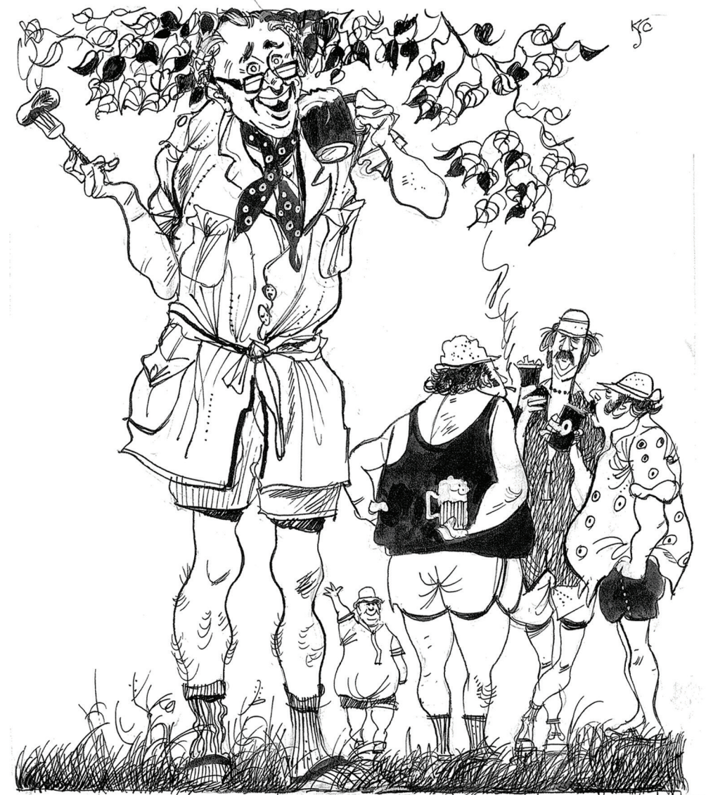
Beers by the barbeque.