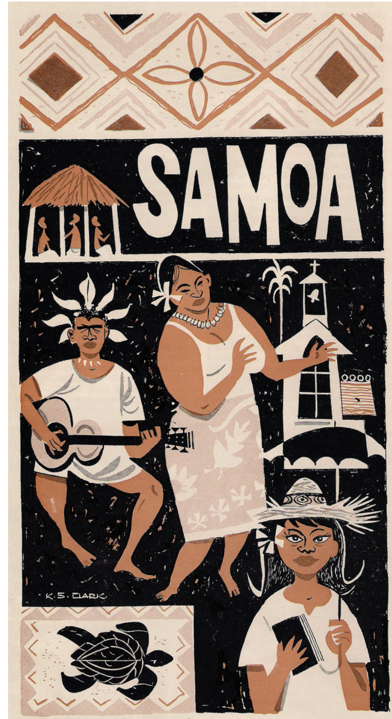
Illustrations for a magazine article on Samoa, with Samoan caricatures, motifs and settings.