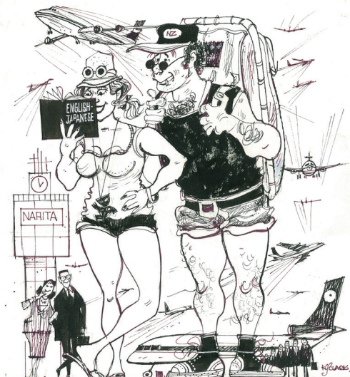
Kiwi Tourists in Japan 230 x 260mm N.Z Herald. 21 December 1985. Clark Family Collection