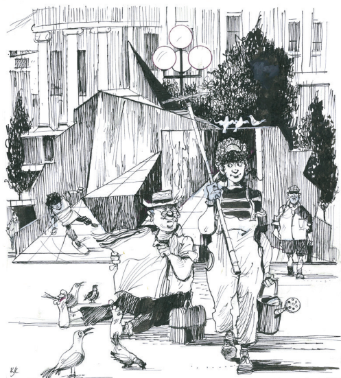
Aotea Square 270 x 320mm N.Z Herald. 22 March 1986. Clark Family Collection