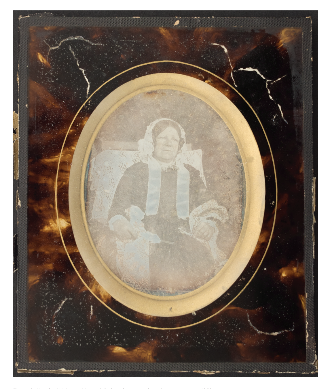
Figure 2, Hartley Webster. Hannah Baker . Quarter-plate daguerreotype, 1852. Mount size 157mm x 129mm. Private collection.