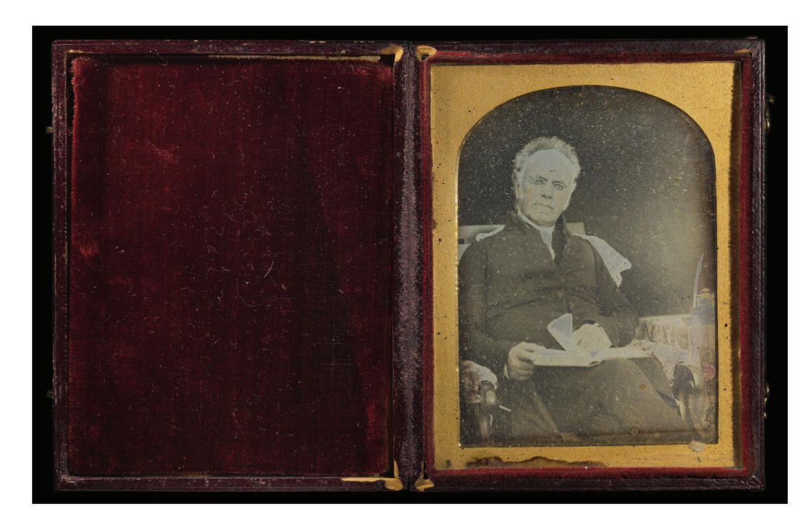
Figure 4, Hartley Webster. Archdeacon Henry Williams . Quarter-plate daguerreotype, 1852. Case size 120mm x 95mm. PH-1964-2-1, Auckland War Memorial Museum.